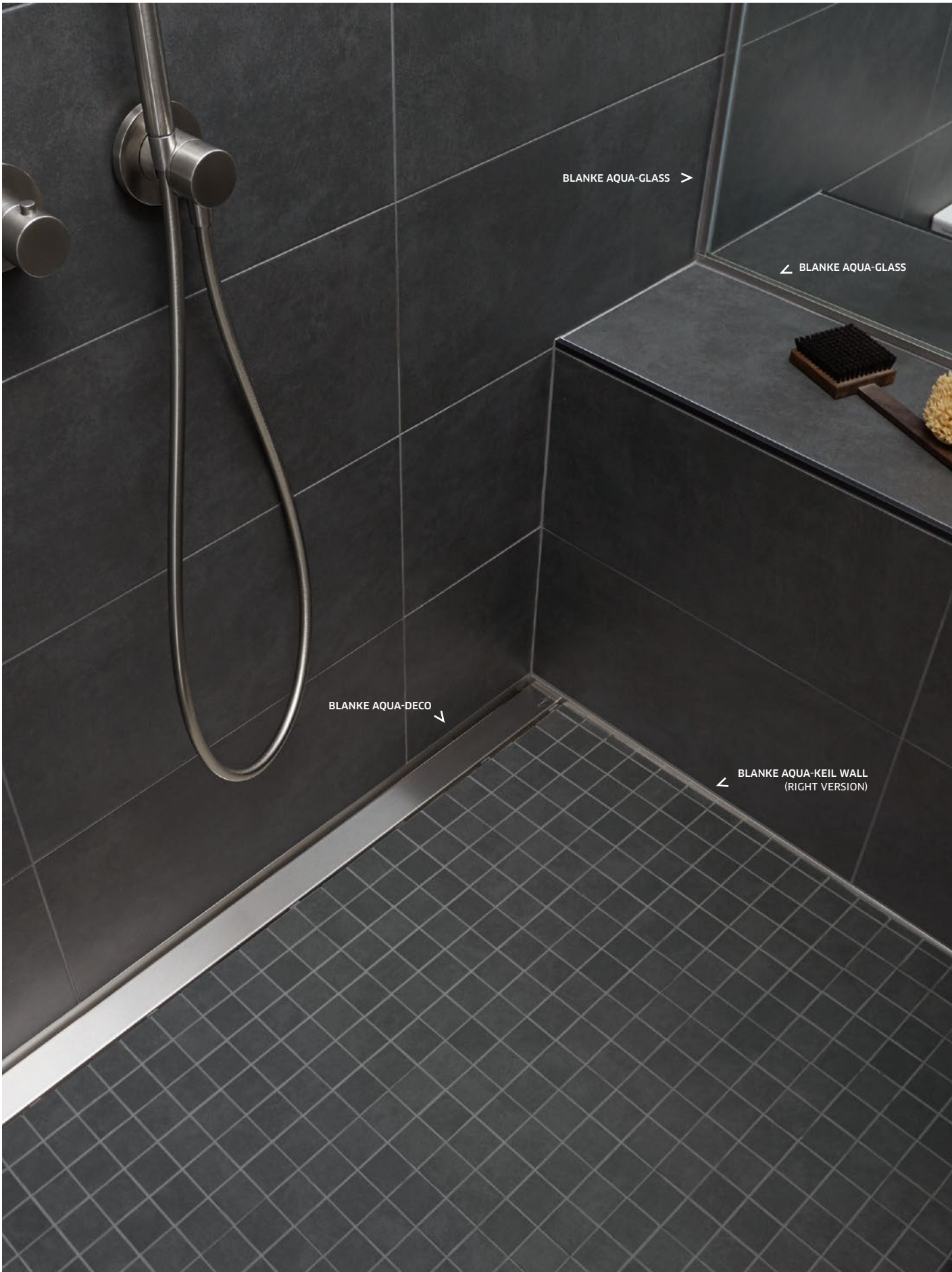
BLANKE AQUA-GLASS >