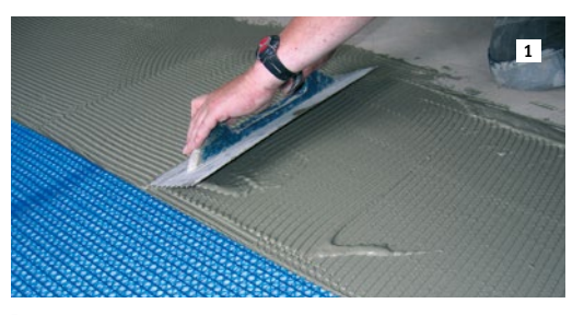
■ APPLY LOOSELY MIXED MODIFIED THINSET TO THE SUB-STRATE USING A ¼" × ¼" NOTCHED TROWEL.