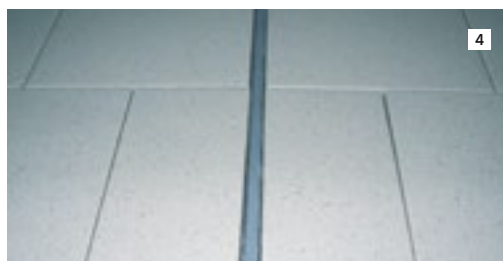
4 REMEMBER TO INSTALL PERIMETER JOINTS AND BLANKE EXPANSION JOINTS PER TCNA GUIDELINES EJ171.**