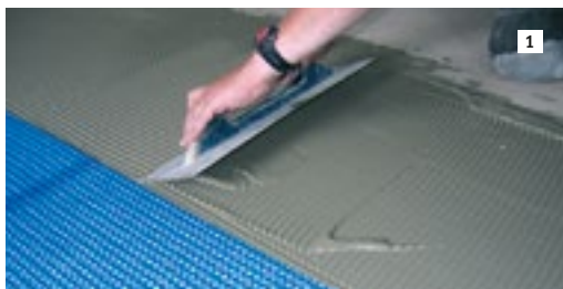
1 APPLY LOOSELY MIXED MODIFIED THINSET TO THE SUBSTRATE USING A 1/4" x 1/4" NOTCHED TROWEL.

100% Secure drying of the adhesive guaranteed