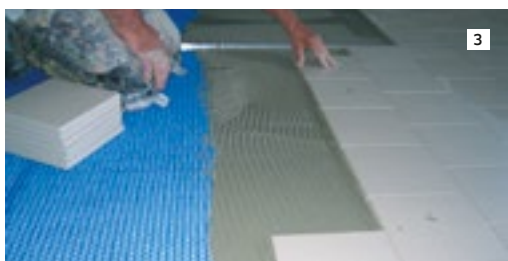
3 WORK THIN-SET MORTAR INTO THE SURFACE OF BLANKE PERMAT AND SET THE TILES.