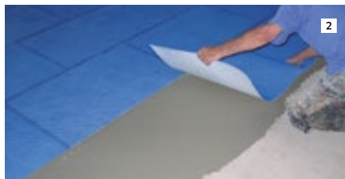
2 INSTALL BLANKE PERMAT FLEECE-SIDE DOWN, MAKING SURE TO OVERLAP AND KEEP 3" MIN. OFFSET PATTERN.*